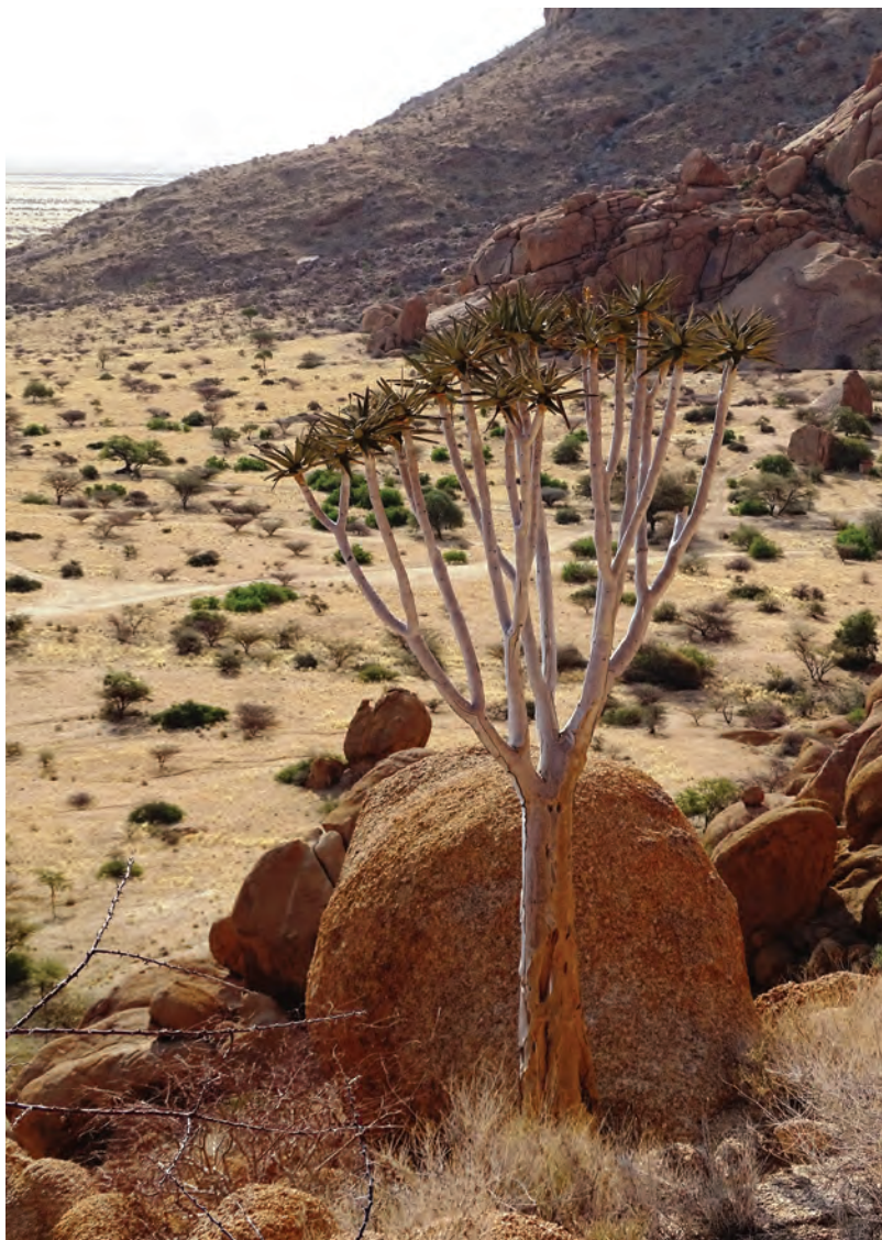
▲ Communal conservancies, owned and managed by local communities, cover more than 20% of Namibia. They include 9% of Namibia's population and are managed for biodiversity conservation and livelihoods.

within the context of recognized area-based conservation measures and their ability to deliver positive long-term conservation outcomes. It is based on guidance from the International Union for Conservation of Nature (IUCN) and other published sources, and is consistent with decisions of the Conference of the Parties to the Convention on Biological Diversity (CBD).